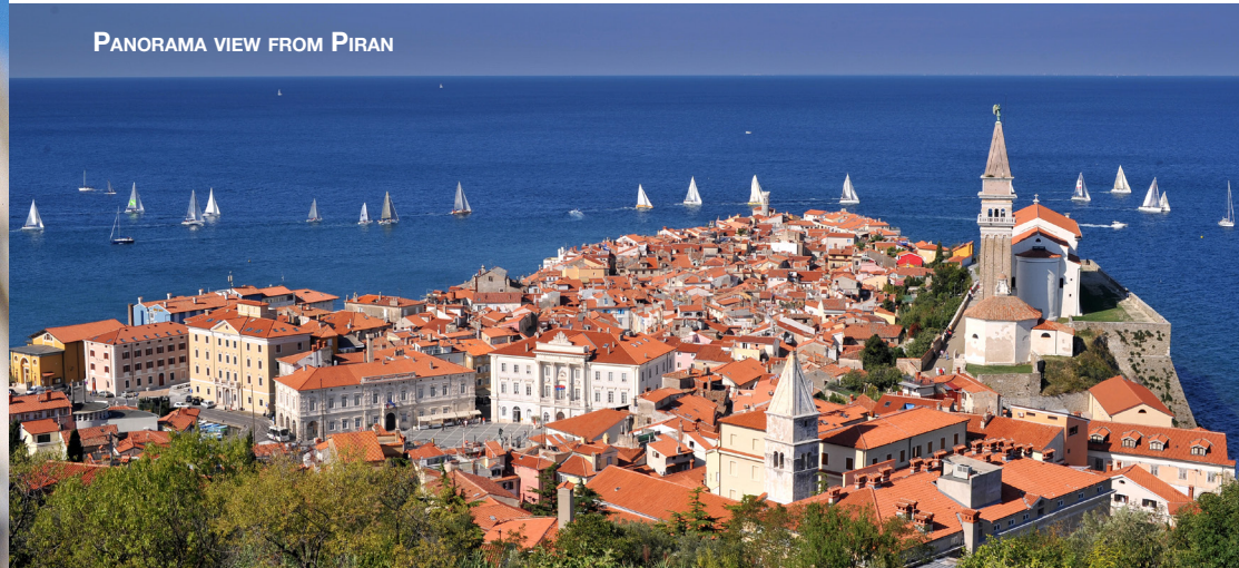
PANORAMA VIEW FROM PIRAN

If the Tartini Square is the heart of the town then the 1st of May Square, also known as the Old Square, must be the heart of the old Punta quarter. It used to be the administrative centre of town up until the 13th century. Here you can enjoy a glass of local wine, do some shopping and it's child-friendly too. Its central elevated platform is the venue for many events during summer.