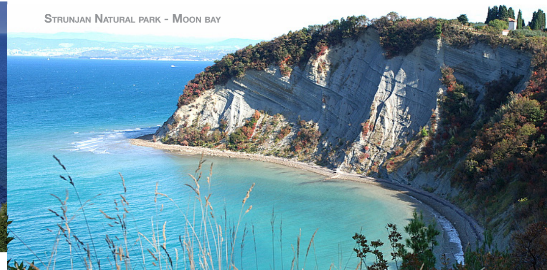
STRUNJAN NATURAL PARK - MOON BAY

If the Tartini Square is the heart of the town then the 1st of May Square, also known as the Old Square, must be the heart of the old Punta quarter. It used to be the administrative centre of town up until the 13th century.