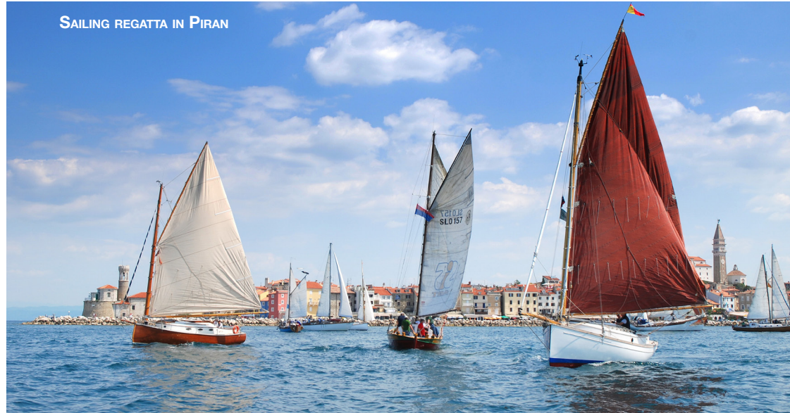
SAILING REGATTA IN PIRAN

Looking at the MAJESTIC CITY WALLS , and when walking along their ramparts, it's hard to imagine that WORK ON THE FIRST CITY WALLS MOST LIKELY BEGAN IN THE DISTANT 7TH CENTURY . The walls were meant to protect the town. They were its shield, A SAFE EMBRACE . And so, in 1991, Piran became a member of the European Walled Towns Association. What once represented safety is now, luckily, a long standing tourist attraction. Nevertheless, the walls still cradle the town and they are, in its entirety, recognised as a protected monument of cultural heritage. Within their embrace they hold streets and squares, palaces,