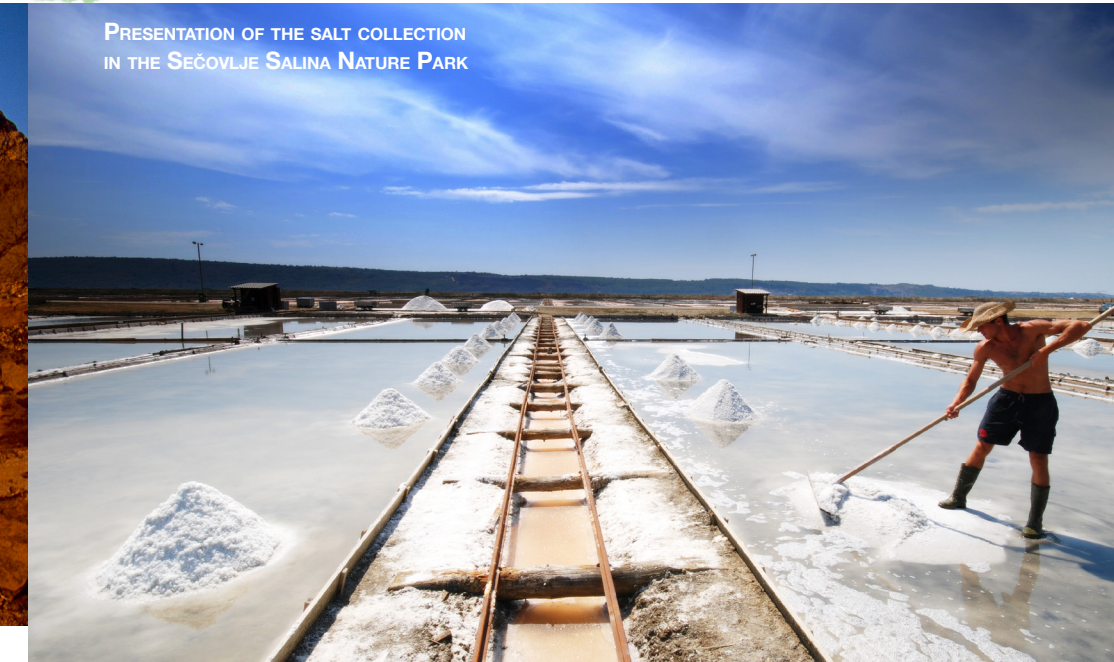
PRESENTATION OF THE SALT COLLECTION IN THE SEČOVLJE SALINA NATURE PARK

The museum also offers permanent external exhibitions: in VILLA SAN MARCO IN PORTOROŽ , TONA'S HOUSE IN SVETI PETER and the SALTMaking MUSEUM IN THE SEČOVLJE SALT PANS .